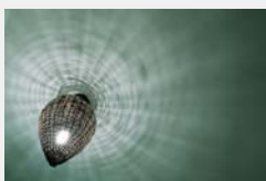
TETRA RED ROOM