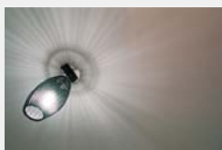
HALF BLACK ROOM