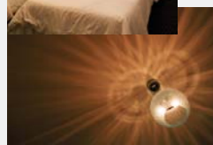
DANIO BLUE ROOM